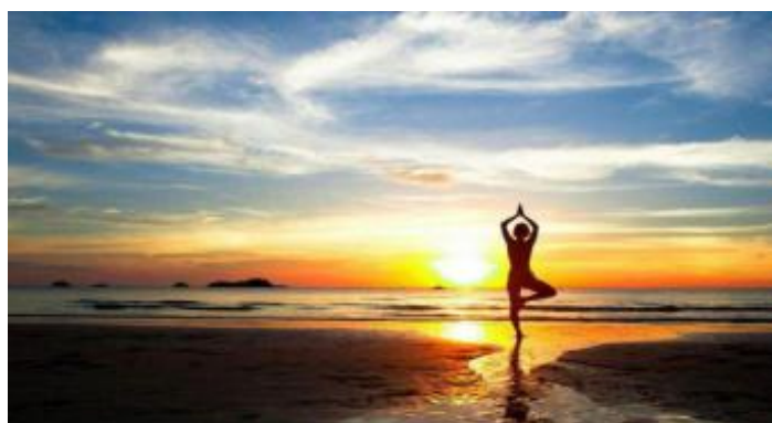
Figure 3 The hopeful college students are doing physical exercise

The rapid development of social economy makes the pressure of life increasing, and the most affected is the physical and mental health of college students. especially in the face of employment pressure. The social competition is becoming increasingly fierce, and the physical and mental state of college students is always in a high state of tension from the beginning of college, which directly or indirectly affects the physical health of college students. The pressure of working life is too great. College students' physique showed a significant downward trend, and cardiopulmonary function was also greatly affected. Even during physical exercise, explosive power and endurance also showed a downward trend. The overall physical quality of college students in China is not optimistic, obesity rate, myopia rate are significantly improved. University is the link between school and society, if the physical quality of college students is poor in the future it is difficult to survive in the fierce society.