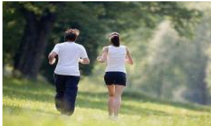
Figure 1 The ongoing health exercise process

Health education is to promote the conscious adoption of healthy behaviours and lifestyles through planned, organized and systematic social and educational activities, to eliminate or mitigate risk factors affecting health, to prevent diseases, to promote health and to improve the quality of life [2]. Physical health education is from sociology, psychology, humanities, biology, physiology, sports mechanics and other different angles, the basic principles of human sports health and guiding exercise methods. Only in the case of health education, whether the students are sports students or not, health education should be systematically understood and linked. in the study of relevant health education. And for the students of physical education courses, only the professional things to systematize the theoretical study and development, can better serve the society.